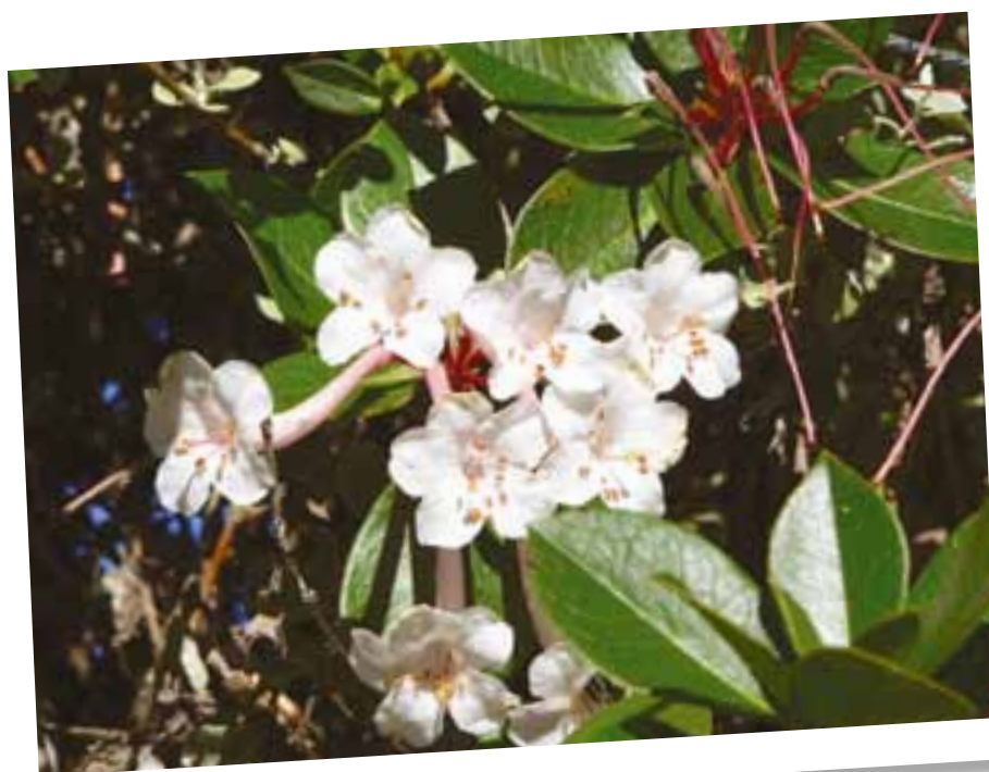
RHODODENDRON TUBA (VIREYA) AT OKERE FALLS

A few more: Meryta denhamii from New Caledonia, a close relative of our native Puka, has grown slowly but steadily over the last few years, with very handsome large glossy leaves; the tree fern Cyathea robusta from Norfolk Island lived up to its name and had to be shifted. It has very lush fronds with pale brown scales underneath, like an albino mamaku ( C. medullaris ) on steroids. Luculias , such as Luculia gratissima , with lovely scented pink flowers through the winter, are highly recommended for this district.