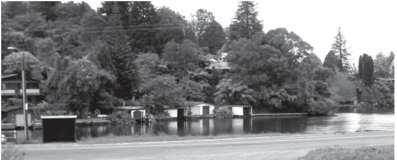
The view from the outside seating at the soon to open Okere Falls Store