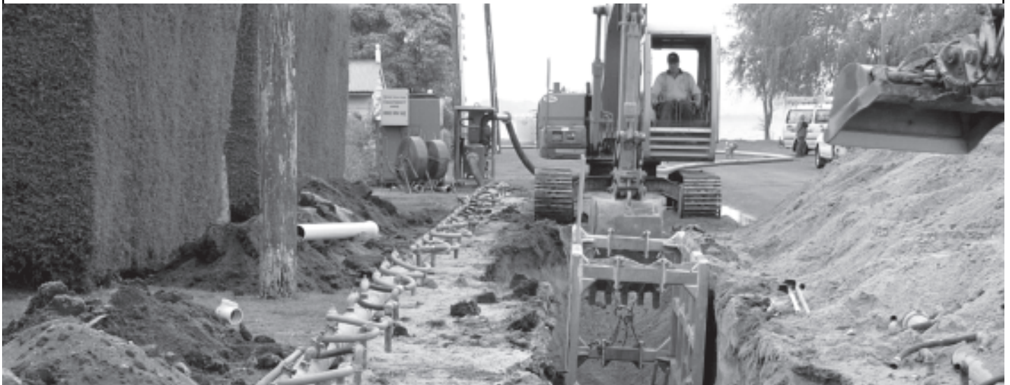
Pipelaying for the Eastern Sewerage Scheme