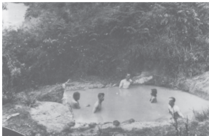
Manupirua Springs, 1901

Hours:- MON - FRI: 8.30 AM - 5.30 PM SAT: 9.00 AM - 1.00 PM